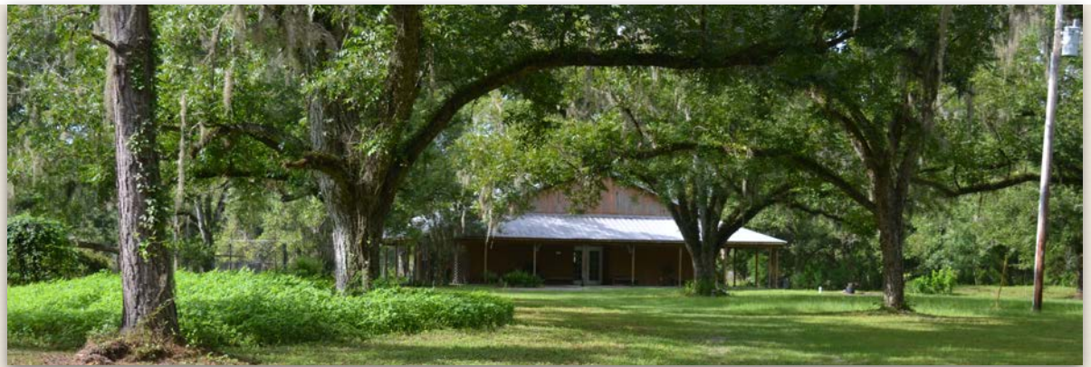
Peace Education Center - A large interior space w/kitchen, two large bathrooms., fireplace & WiFi.