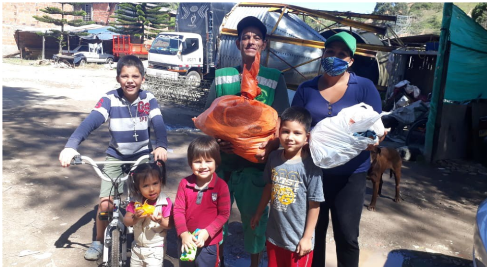
Peace Basket / PAN PAV in Medellin, Colombia.

In 2020 we were able to enlarge and extend the work of Peacebuilding en las Américas (PLA), despite the restrictions for the COVID-19 pandemic. Our partners reached out to neighbors in need, Alternatives to Violence Project facilitators and participants, refugees, youth forced to work to provide basic essentials for their families instead of continuing in school, indigenous women's groups, and inmates at a local prison with "Peace Baskets" containing food and hygiene products.