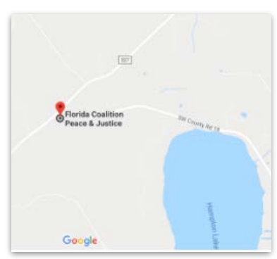
10665~\mathrm{SW} 89th Ave. Hampton FL 32044