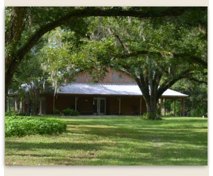
Peace Education Center