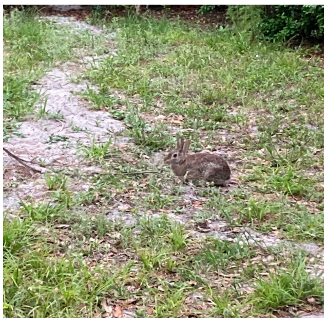
SEYM 2025 Yearly Meeting