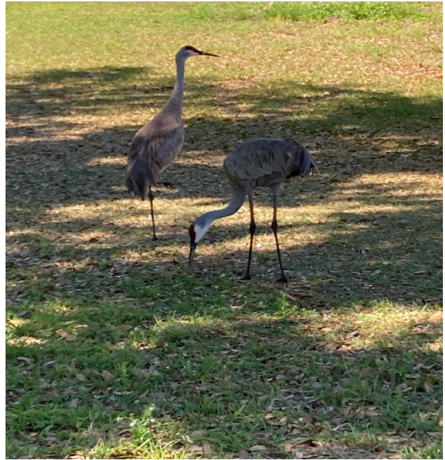
Sandhill Cranes, Lake County (FL)