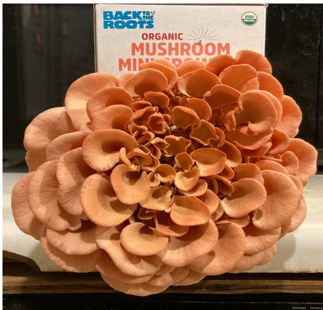
Pink Oyster Mushroom Kit, 2025.05.12