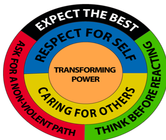
The AVP Mandala

academia, especially institutions and centers, EEI is experiencing challenges. Asked to do more with fewer resources. To better understand and appreciate the work of EEI, please take a look at its Online Resources webpage, https://libraryguides.mdc.edu/eei/onlineresources ;