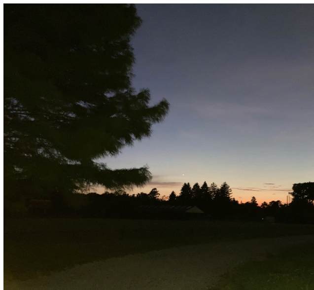
Haverford College 2024.07.03