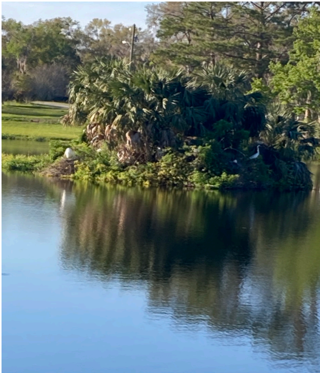
Lake Palm, Lake County (FL)