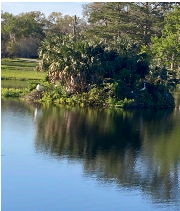
Lake Palm, Lake County (FL)