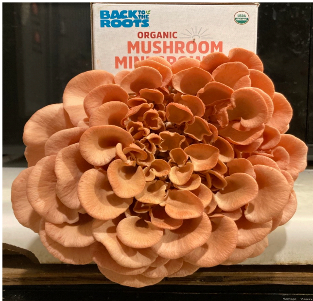
Pink Oyster Mushroom Kit, 2025.05.12