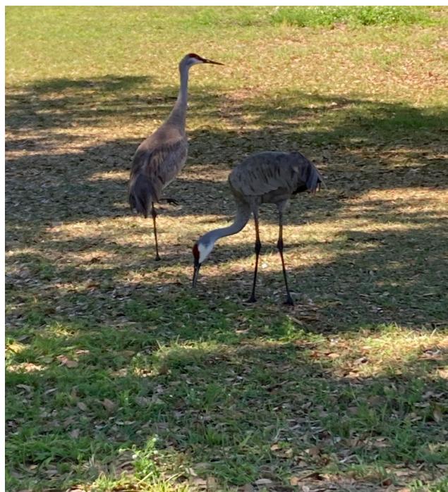
Sandhill Cranes, Lake County (FL)