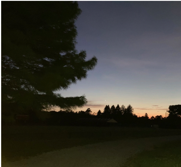
Haverford College 2024.07.03