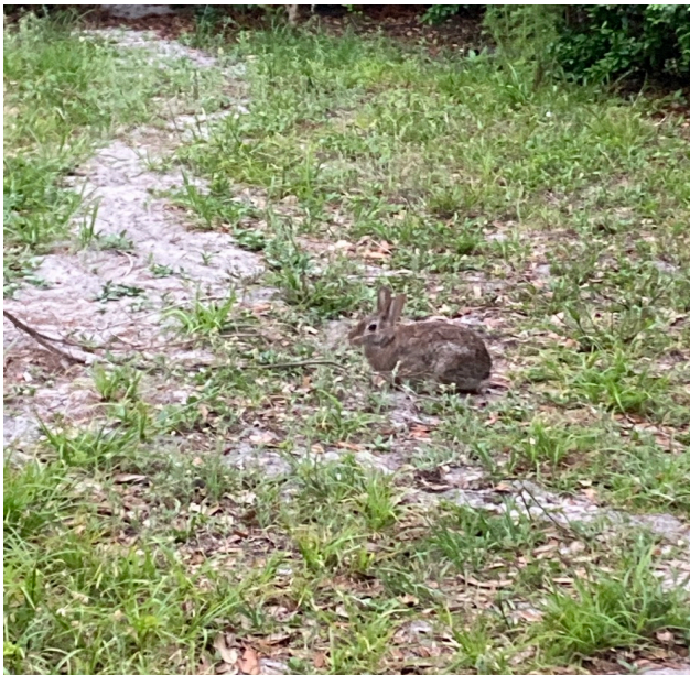
SEYM 2025 Yearly Meeting