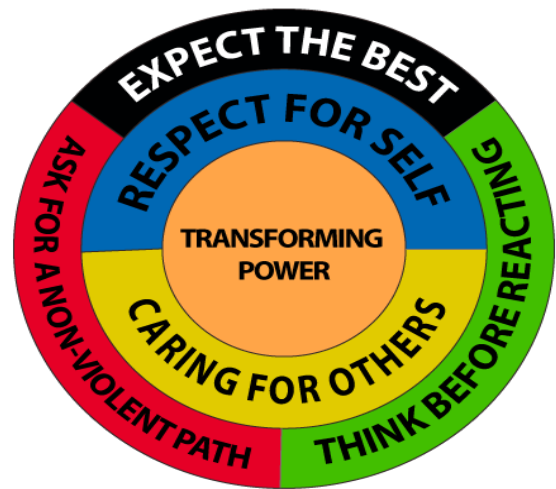
The AVP Mandala

academia, especially institutions and centers, EEI is experiencing challenges. Asked to do more with fewer resources. To better understand and appreciate the work of EEI, please take a look at its Online Resources webpage, https://libraryguides.mdc.edu/eei/onlineresources/ ;