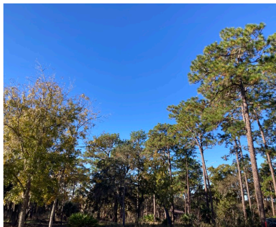
Wekiwa Springs State Park

Over the course of the last fiscal year, these contacts have been beneficial in helping to discern actions in response to various concerns, such as the proliferation of immigration detention facilities; the federal and state actions to undo environmental regulations; the attacks on human and civil rights; and the impacts of these actions. I continue to be grateful to the Committee for their care and support.