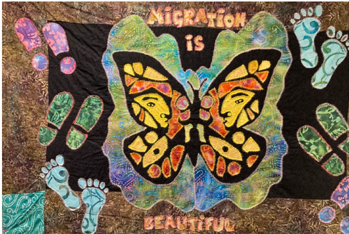
Migration is Beautiful, Fabric Art, Florida People's Advocacy Center