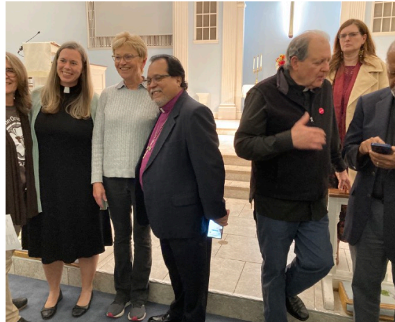
Participants in the Florida Council of Churches Advocacy Days Worship