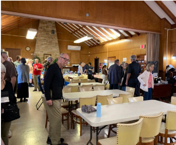
Winter Interim Business Meeting, Orlando, 2026