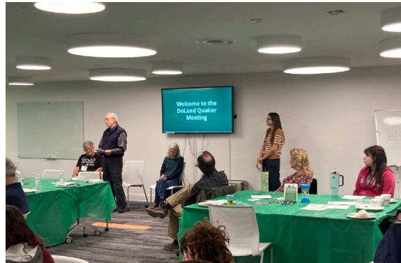
Stetson University, 2026.02.09