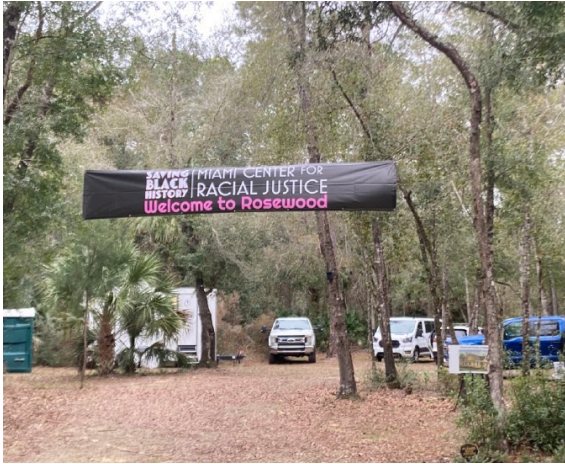
Rosewood Park Launch & Dedication, 2026.01.11