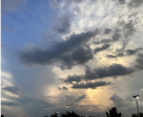
Mt. Dora, FL 2025.08.21